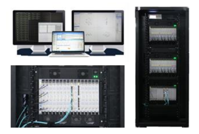
Figure 3. Accuver MAIS system.